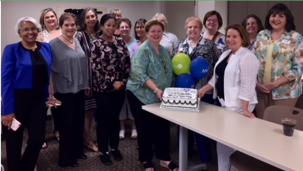
Women's Equality Day 2018